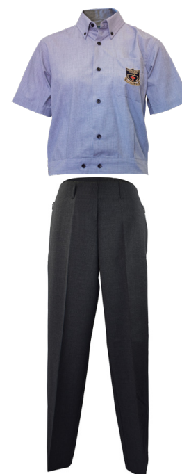
Short Sleeve Banded Shirt and Tailored Trousers