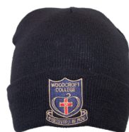
Woodcroft College Beanie