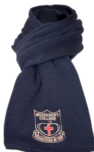
Woodcroft College Scarf