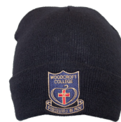
Woodcroft College Beanie