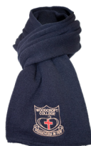
Woodcroft College Scarf