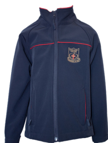
Sport Softshell Jacket