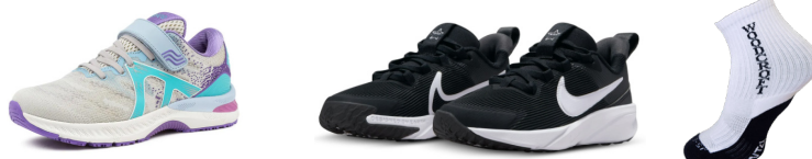
Supportive Athletic Shoes and Sport Socks

No skate shoes/street shoe (ie: Adidas Samba/Converse/Vans or similar).