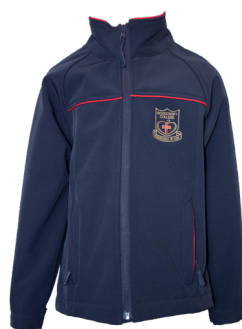
Sport Softshell Jacket