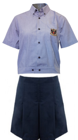
Short Sleeve Banded Shirt and Junior Culottes

Junior Culottes can still be worn, but are no longer available for sale in the Uniform Shop.