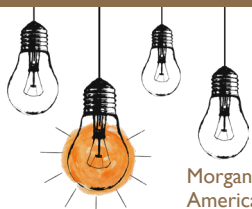
Morgan Harper Nichols (1990 - ), American artist, poet and musician

“The same light you see in others is shining in you, too.”